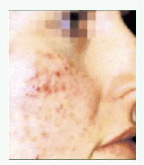
Fig. 4: Typical Acne Vulgaris

In addition, a change in facial appearance can be caused by changes in skin turgor (plumpness) triggered by a decrease in the supply of fluids to the connective tissue together with uneven distribution of fat (a change of fat density downwards in the cheeks resulting in "drooping jowls") as a result