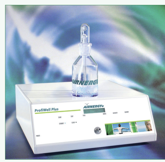
Fig. 5: Airnergy device

In particular, the protein carbohydrate complexes produced from the fibrocytes filter metabolic products are able if need be to bond these on account of their negative charge. The capture of harmful substances leads in the long run to the formation of "dumps" and "slagging" of basic tissue. The diffusion capacity