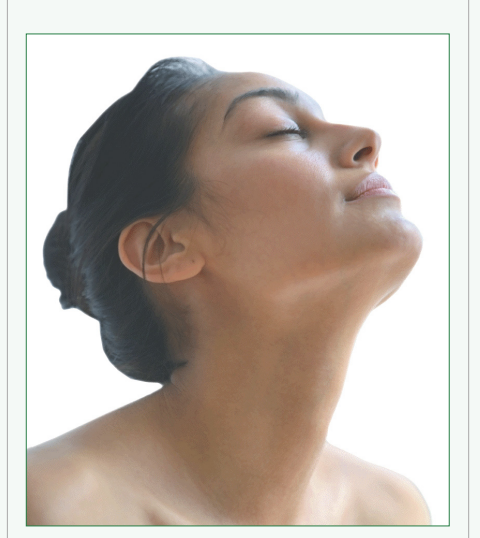
Fig. 1: Beauty

In everyday usage "beautiful" usually describes something which leaves a particularly pleasant impression behind, whether it be the body, a piece of music, a movement or even experiences. Beauty overlaps with the concepts "harmony" and "symmetry" and a demarcation in respect of what is "sensually overpowering" or "merely" pretty is sometimes difficult.