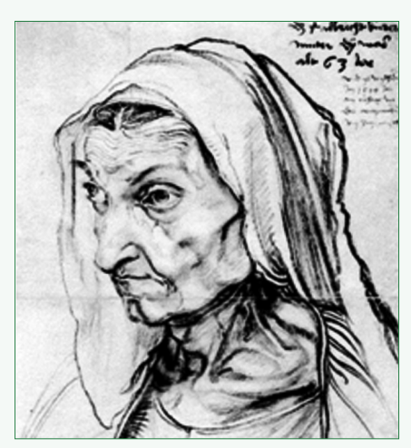
Fig. 3: Albrecht Dürer's "Portrait of Dürer's Mother" (Charcoal drawing, 1514).

Even though the aging process may differ greatly from one person to another there are certain principles which are inescapable and undeniable.